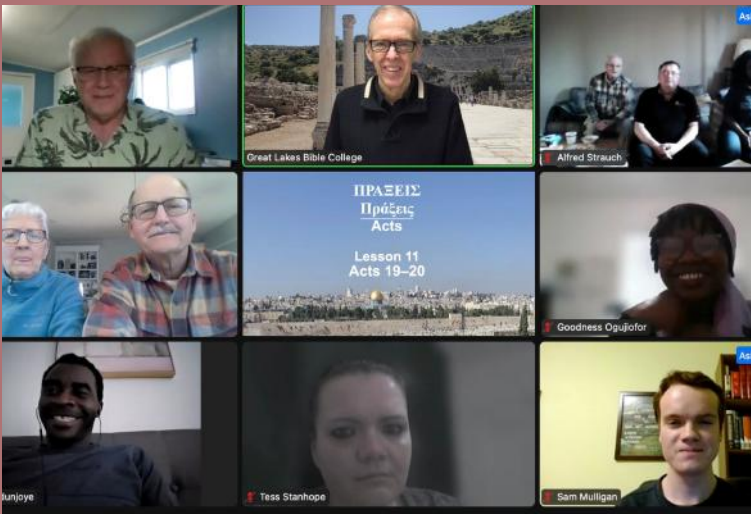
Students, including Group from Regina, SK auditing the Book of Acts.

This short course, which is currently in session, began on March 7, and will continue until April 25. This eight (8) week course is offered online and at hybrid sites, for two (2) hours per week. In this class, we are examining the Gospels, and the historical content into which Jesus came to learn what Jesus has revealed about what we should believe, what we should do, and who we should be.